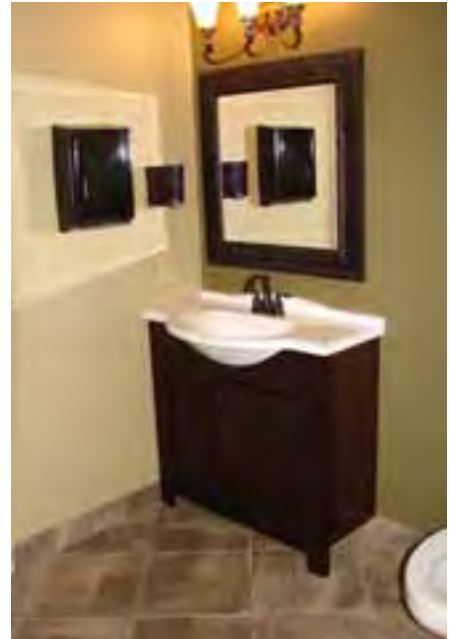
New fixtures in the outdoor pool restrooms have an elegant look that provides modern efficiency while retaining an antique appeal.

And, we replaced all the dated and worn Ping Pong tables.